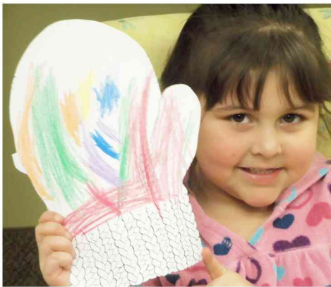
Story Time January 12, 2016