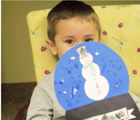
Story Time January 7, 2016