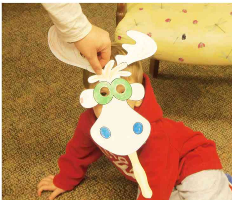
Story Time January 21, 2016