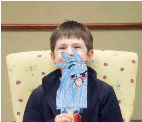
Story Time May 3, 2016