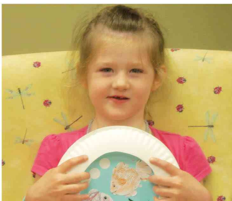
Story Time May 17, 2016