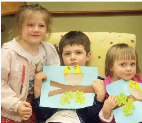
Story Time May 10, 2016