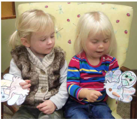
Story Time November 19, 2015