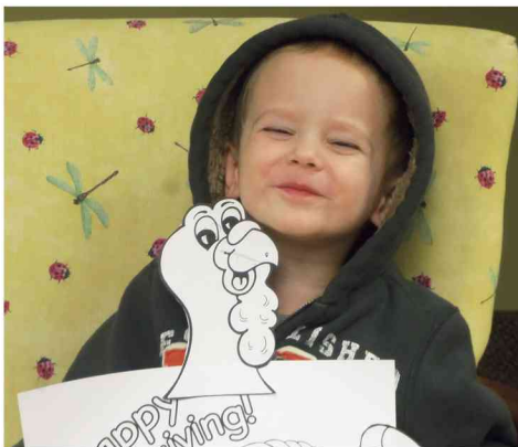
Story Time November 24, 2015