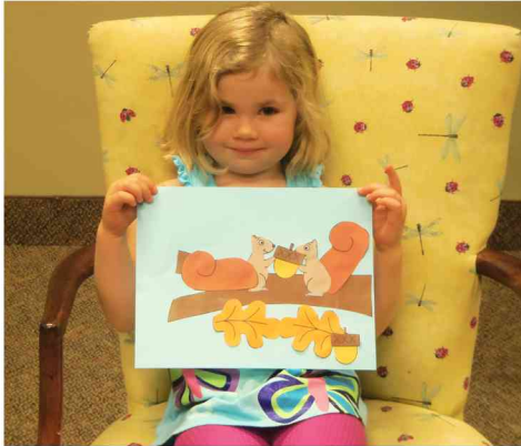
Story Time November 10, 2015