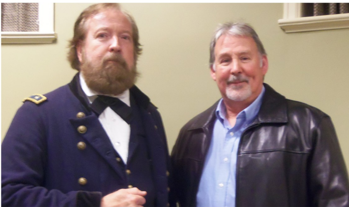
2013: A Great Year of Reading!

It's that time of year again - the time when all good readers take stock of the best books they've read in the past year. What was your favorite?