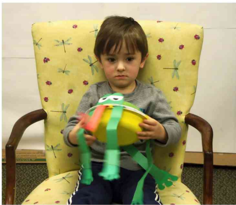
Story Time April 16, 2015