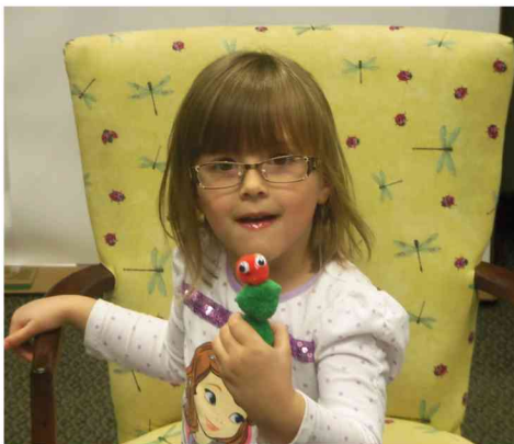
Story Time April 23, 2015

BAM! POW! READ! All ages of readers will explore stories of heroes this summer as the Clyde Public Library presents "Every Hero Has a Story" during the Summer Reading Program. Activities will include costume creation, group games, physical challenges, crafts, science, engineering experiments, and more! The 2015 Summer Reading Program is open to young people, preschoolers through tweens, with programs, prize drawings, Story Times, a reading club, and more. Families are invited to join the Read-to-Me portion of the program. The Clyde Public Library's program will run from June 15 - August 8, 2015 , with registration starting Monday, June 1 . For more information, please call 419-547-7174 or visit our website, www.clydelibrary.org .