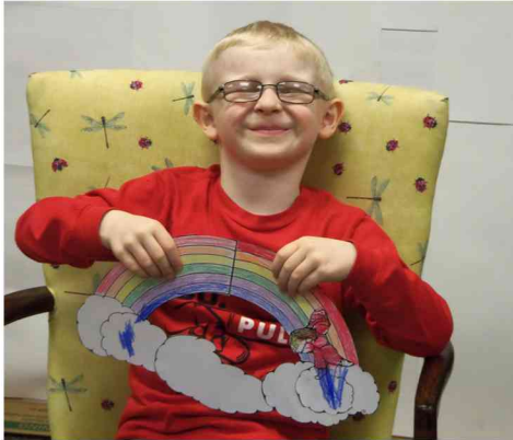
Story Time April 9, 2015