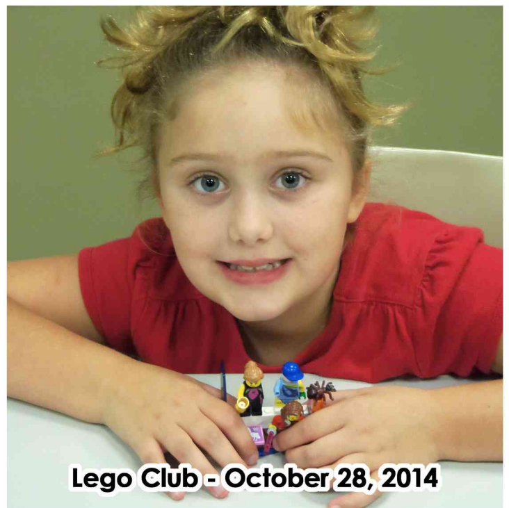
Lego Club - October 28, 2014

No matter the weather, the library is here for you. Visit us today!