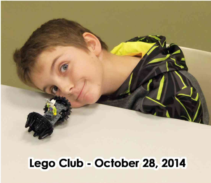
Lego Club - October 28, 2014

Fall is definitely upon us! The trees are displaying their finery, apples and pumpkins abound, and there is a nip in the air. Now is the perfect time to get out the flannel blankets, make a warming fire in the woodstove, and gather your supplies from the Clyde Public Library!