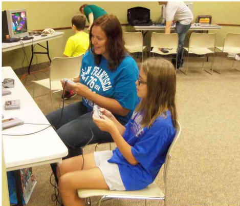
National Video Game Day September 12, 2015