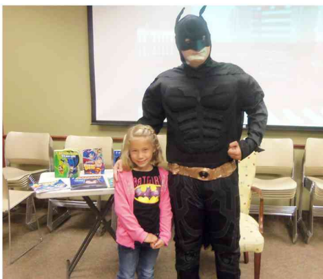
Story Time with Batman September 26, 2015