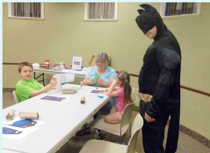
Story Time Crafts with Batman - September 26, 2015

10:00 - 11:00 am La Tertulia - Clyde Public Library Spanish Club