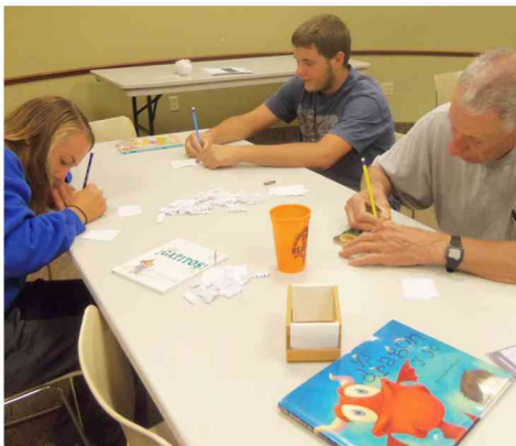
La Tertulia September 26, 2015