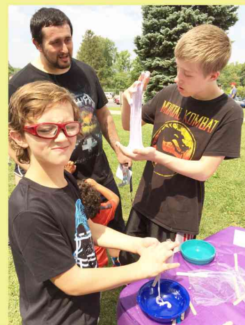
Monday August 21 Galaxy Slime Table

10:00 - 11:00 am La Tertulia - Clyde Public Library Spanish Club