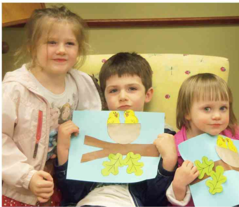
Story Time April 15, 2016