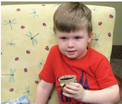
Story Time April 21, 2016