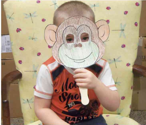
Story Time April 5, 2016