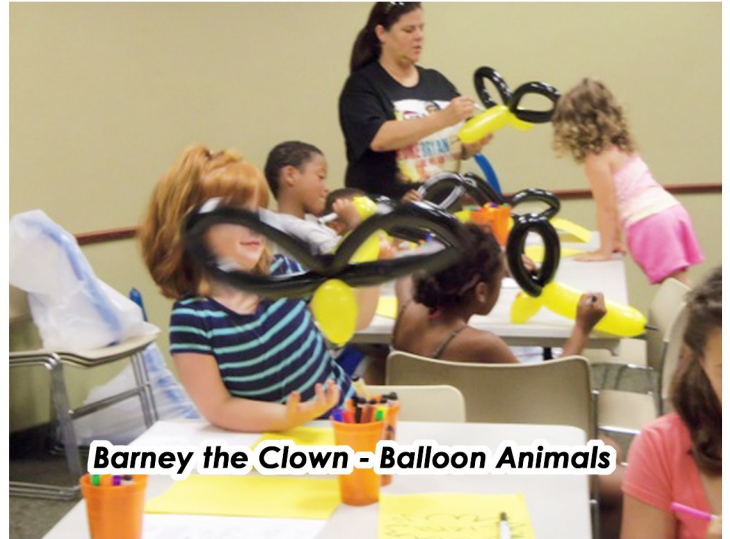
Barney the Clown - Balloon Animals