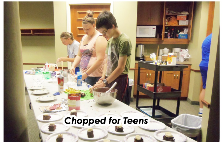
Chopped for Teens