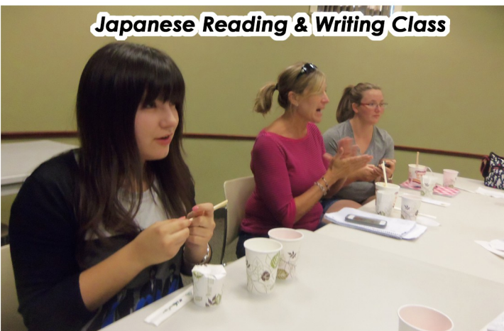
Japanese Reading & Writing Class