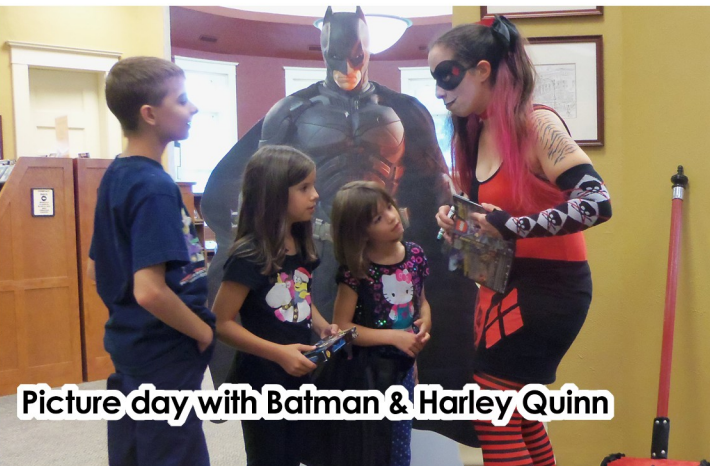
Picture day with Batman & Harley Quinn