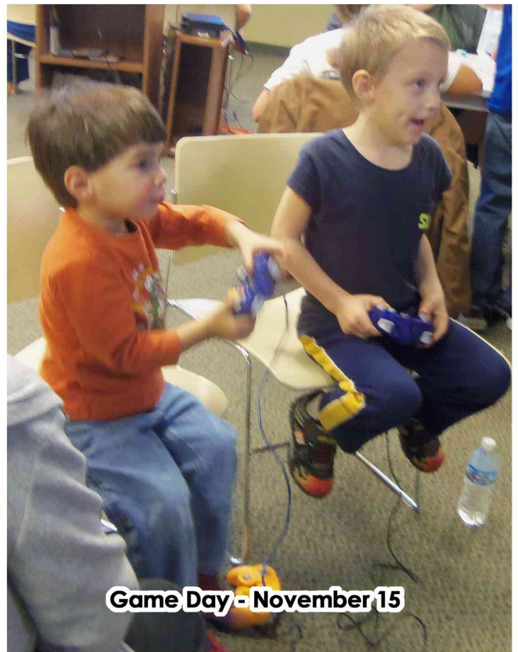
Game Day - November 15

Suggested Products: Canned goods, boxed meals, applesauce, pie filling, boxed stuffing, cake mixes, paper towels, toilet and facial tissue, shampoo, soap, napkins.