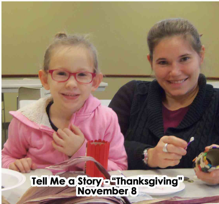
Tell Me a Story - "Thanksgiving" November 8

Cookbook Club! Do you love browsing through cookbooks and trying new recipes? Do you enjoy sampling and sharing new dishes? Then grab your apron and sign up for the Clyde Public Library's brand new book club!