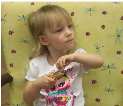
Story Time May 21, 2015