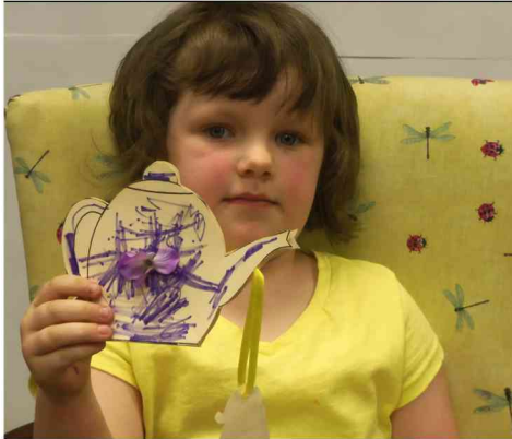
Story Time May 7, 2015