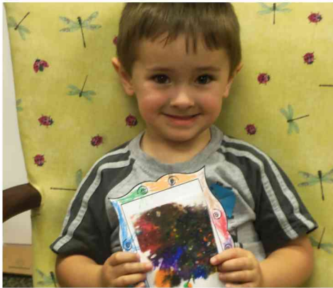
Story Time May 14, 2015