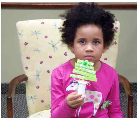
Story Time December 16, 2014