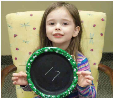
Story Time December 9, 2014