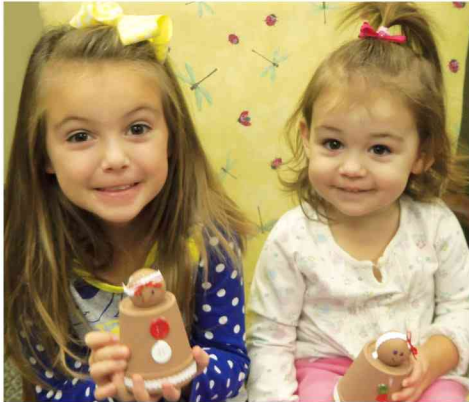
Story Time December 4, 2014