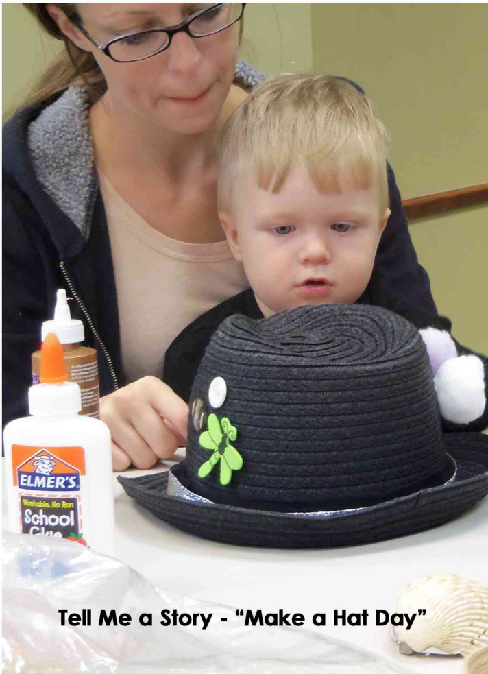
Tell Me a Story - "Make a Hat Day"